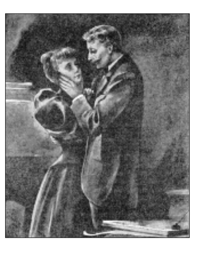
Above: Communicating before marriage. Below: communicating in marriage.

health and sexual issues as seen through the lens of eugenics. The text combines traditional views of women's roles with some pragmatic advice about love, marriage, choice of mate, and the bad habits of men. In the section "Was die Frauen an Männern lieben," we are told that women love courage, strength, and firmness in men. "Die Frau wird einen Feigling naturgemäß verachten und sie hat nur wenig oder gar keine Achtung für einen Mann, der sich geniert" ["Woman naturally despises a coward, and she has little or no respect for a bashful man"]. A